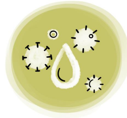
Communicable Disease Prevention